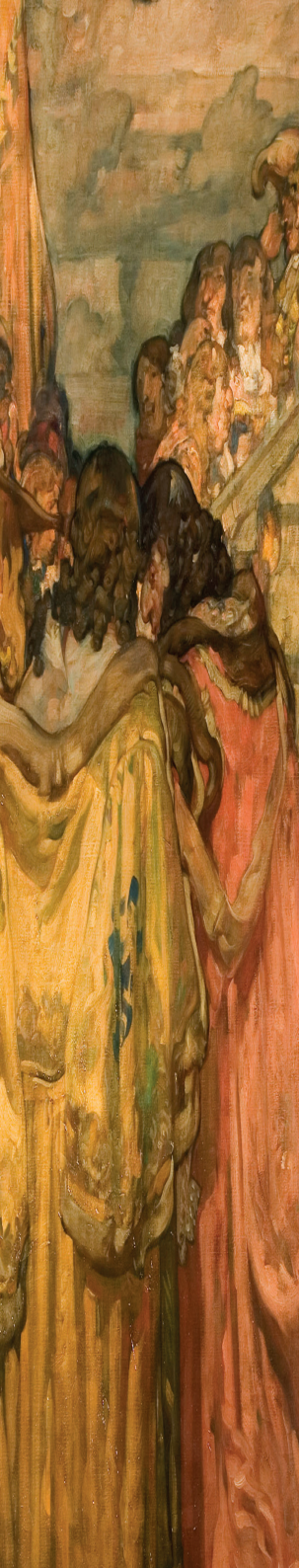
Frank Brangwyn: Reception of General Monk 1908